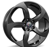
18" 'Dynamic' (Code 68P)