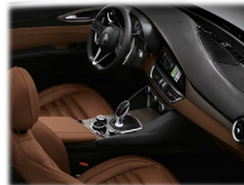
Tan "Pieno Fiore" leather with Grey Oak inserts (Super Lux interior code 577 + 8LU) (Veloce interior code 577 + 9KV)