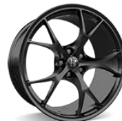
19" 'QV Performance Gloss' (Code 73Z)