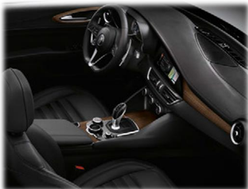
Black "Pieno Fiore" leather with Walnut inserts (Super Lux interior code 499 + 8T4) (Veloce interior code 499 + 9GU)

All combinations include a black leather wrapped upper dashboard & door panel w/ colour coordinated stitching.