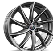
18" 'Turbine' (Code 4WQ)