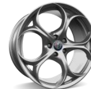
19" 'QV Classic Silver' (Code 74A)