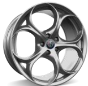
19" 'Veloce Silver' (Code 6Y8)