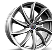
18" 'Turbine Bright' (Code 55E)