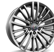
18" 'Luxury' (Code 4AY)