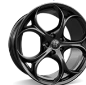
19" 'QV Classic Gloss' (Code 5YN)