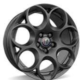
17" 'Sport' (Code 433)