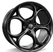
19" 'Veloce' (Code 5EQ)