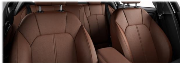
Tan/Black (Interior code 409)