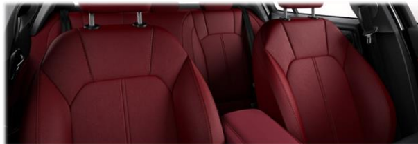
Red/Black (Interior code 411)