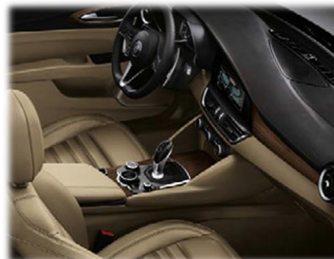
Beige "Pieno Fiore" leather with Walnut inserts (Super Lux interior code 501 + 8T4) (Veloce interior code 501 + 9GU)

All the colour images on this page are matched as accurately as possible to the actual upholstery colours used. However, due to print processes, Alfa Romeo Ireland cannot guarantee that colours shown are 100% accurate. Please contact your local Alfa Romeo dealer for more information.