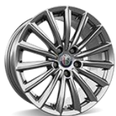
17" 'Elegance' (Code 439)