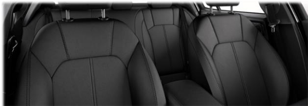
Black/Black (Interior code 433)

Leather upholstery with colour coordinated instrument panel underside, centre armrest & door panel inserts.