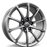
17" 'Style' (Code 420)