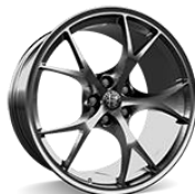
19" 'QV Performance' (Code 5ER)