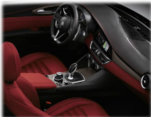
Red "Pieno Fiore" leather with Grey Oak inserts (Super Lux interior code 562 + 8LU) (Veloce interior code 562 + 9KV)