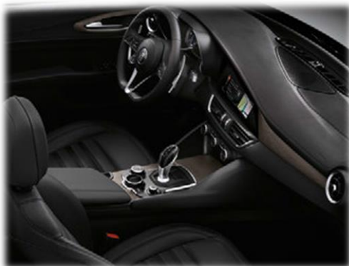
Black "Pieno Fiore" leather with Grey Oak inserts (Super Lux interior code 485 + 8LU) (Veloce interior code 485 + 9KV)